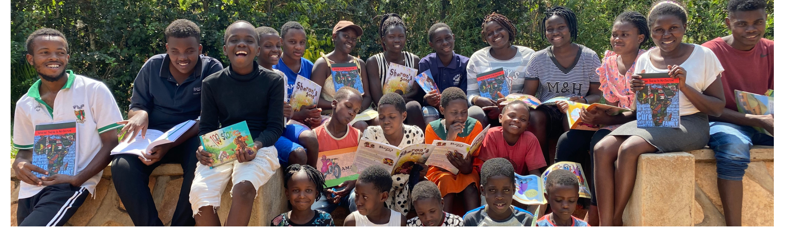
READING IS FUN!

We are grateful to friends that donated books to us. Even During the hard times of lockdown, our kids kept busy reading and studying at home.